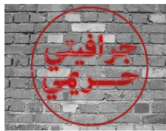
Nazra hosts "Female Graffiti", the first activity of NoonNeswa intiative, which will begin on 9 March - the first anniversary of virginity tests crime

On this basis, Nazra for Feminist Studies supports and hosts the Young Feminist Movement initiative, which seeks to engage with public and private issues from a feminist perspective